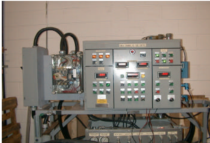
Low Torque Tooling Operator's Control Panel