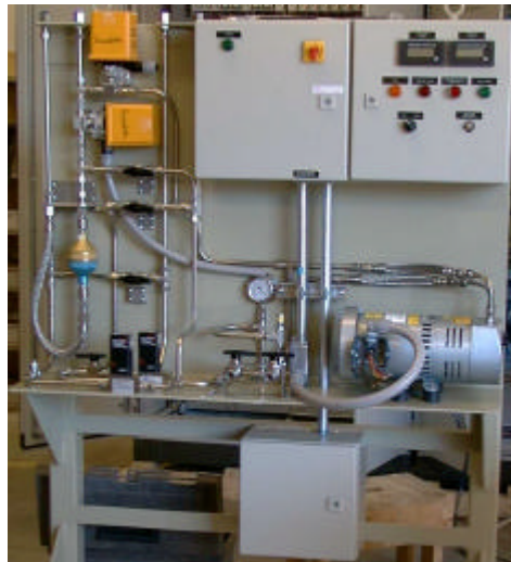
Stack Emissions Monitor Pump and Flow Control Panel